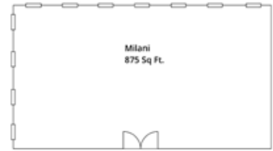
2nd Floor Milani